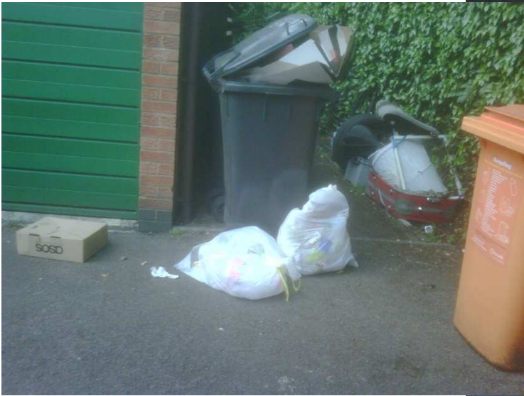
Guilford Court, London Road

Here are some before and after pictures of some of the work carried out: